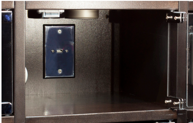
USB Outlet in Locker